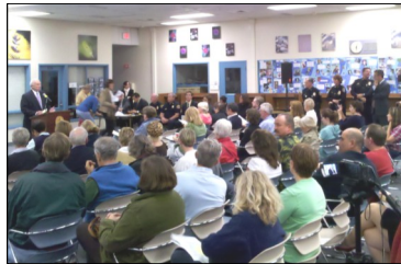
Residents participate in the budget discussion at UC High.

Learn more about the San Diego's FY2012 Budget