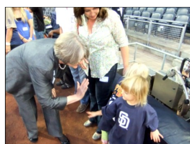
High-fiving a young Padres fan on the field at Petco.